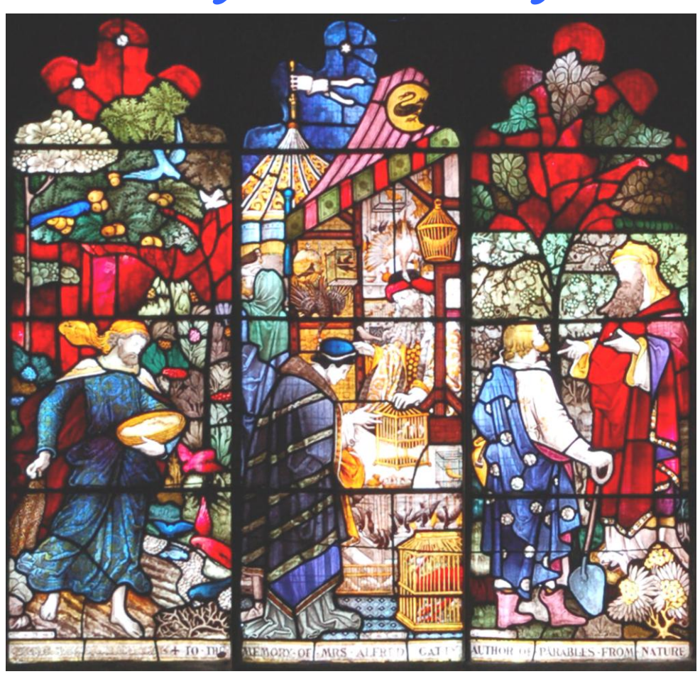
Church Magazine for September 2011