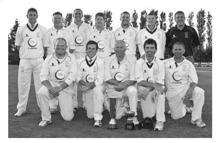
Black Sheep Yorkshire Champions

It is becoming a really exciting finish to the season. Following the retention of the Whitworth Cup last month, Whitley challenged for the Black Sheep Yorkshire Champions Trophy playing in the final on 21^{st} August against Wrenthorpe – and won! As Yorkshire Champions, they go into the fourth week of August once again leading the South Yorkshire Premier League with 93 points, a slim margin of just 1 point above Elsecar with Treeton only 5 points behind. The run in is going to be very tight and with 3 home matches in the last four, you can watch it all at Cinder Hill Lane. With Elsecar playing Treeton on the final day of the season, the title may not be decided until the last match. Whitley are also in the Yorkshire Council Championship which will be played at the end of August and early September. The 2^{nd} XI have had an improving season and stand mid-table in the 2^{nd} Division and should safely retain their place in the Division for next season.