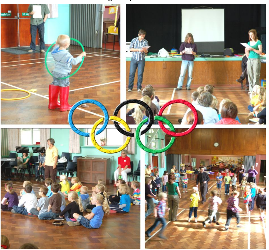
Below is a collage of pictures from the week.

Each day covered a different theme using five Bible stories are taken from the life of Jesus - Direction : the boy Jesus in the temple; Distraction : the temptation of Jesus; Dedication : Jesus heals a paralysed man; Determination : Jesus' death and resurrection; and finally Decoration : Jesus' ascension - alive and victorious!